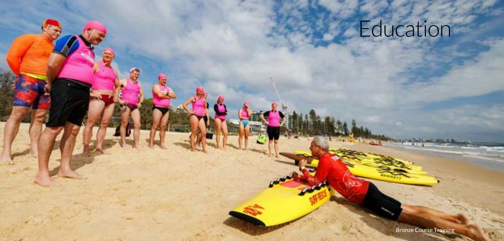
Bronze Course Training

On behalf of the Management Committee and the Training Team, we congratulate members who received new qualifications this season. To the new SRC and Bronze Medallion holders, welcome to Mooloolaba SLSC.