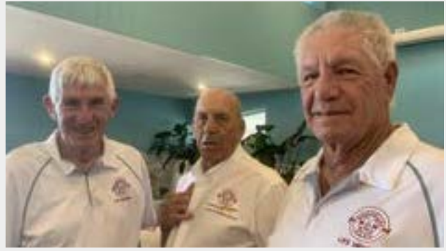
Life members lunch get together 2025

This has been a milestone year for our group as we finalised plans to move to a more formalised structure, with the establishment of a new incorporated body, the Mooloolaba SLSC Life Members & Old Boys Association Inc, otherwise known as MOBS.